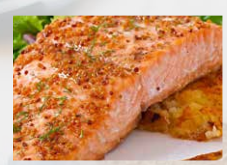
All prices quoted are exclusive of VAT.